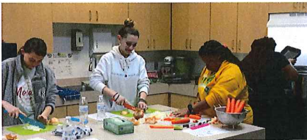
FCS agent helped youth make a healthy meal for area seniors!