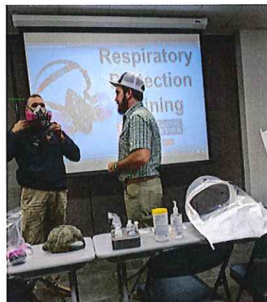
Livestock agent holds Respiratory Fit Test for farmers